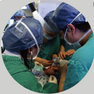
Gynecology and Obstetrics